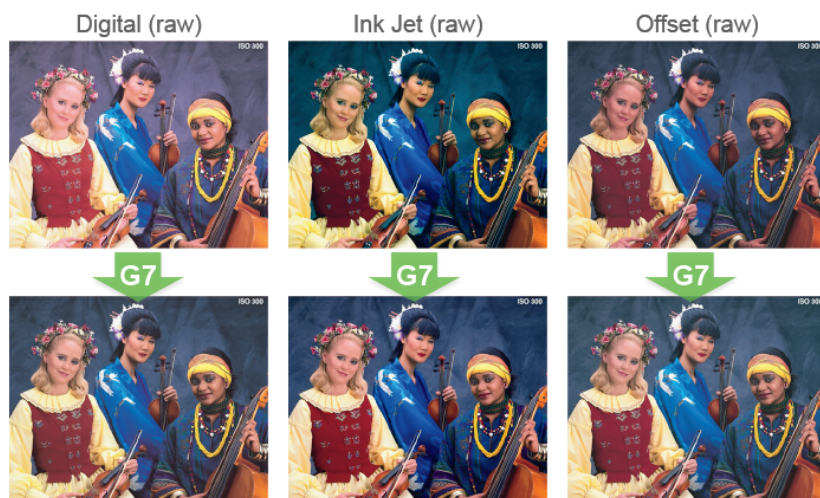
The above set of pictures shows how G7 calibration provides common appearance across multiple print processes.

G7 tonality is the relationship between the dot percentage and printed neu-